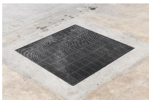
Drain mesh guard