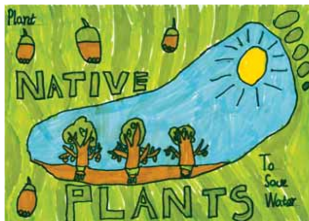
Examples of entries from the 2009 calendar