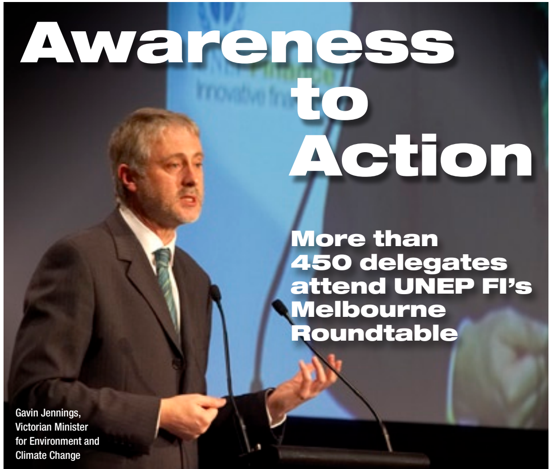
Gavin Jennings, Victorian Minister for Environment and Climate Change

15 Megatrends Spreading the word on sustainable investment