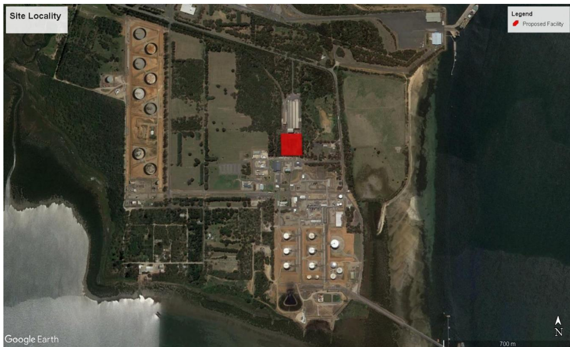
Figure 2-1: Aerial Imagery of Site Locality

The Hastings Generation Project will be constructed at a site adjoining the northern end of ExxonMobil's Long Island Point (LIP) facility. The proposed facility is to be located in an existing industrial area approximately 2km west of the town of Hastings. Figure 2-1 displays the proposed project area in relation to the existing LIP facility.