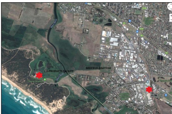
Figure 1: Map showing the location of the PRP facility (Source: Midfield works approval application).