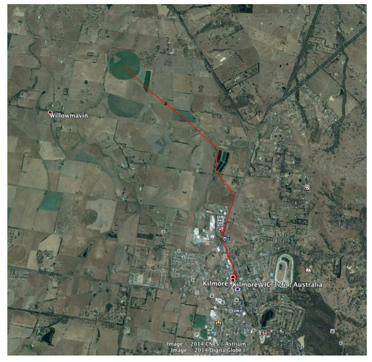
Figure 2-1: Kilmore township and wastewater treatment/disposal

The current treatment process for the Kilmore Wastewater Management Facility involves treatment lagoons. Recycled water is irrigated through a centre-pivot, with an adjacent winter-storage to hold it outside the irrigation season (see Figure 2-1).