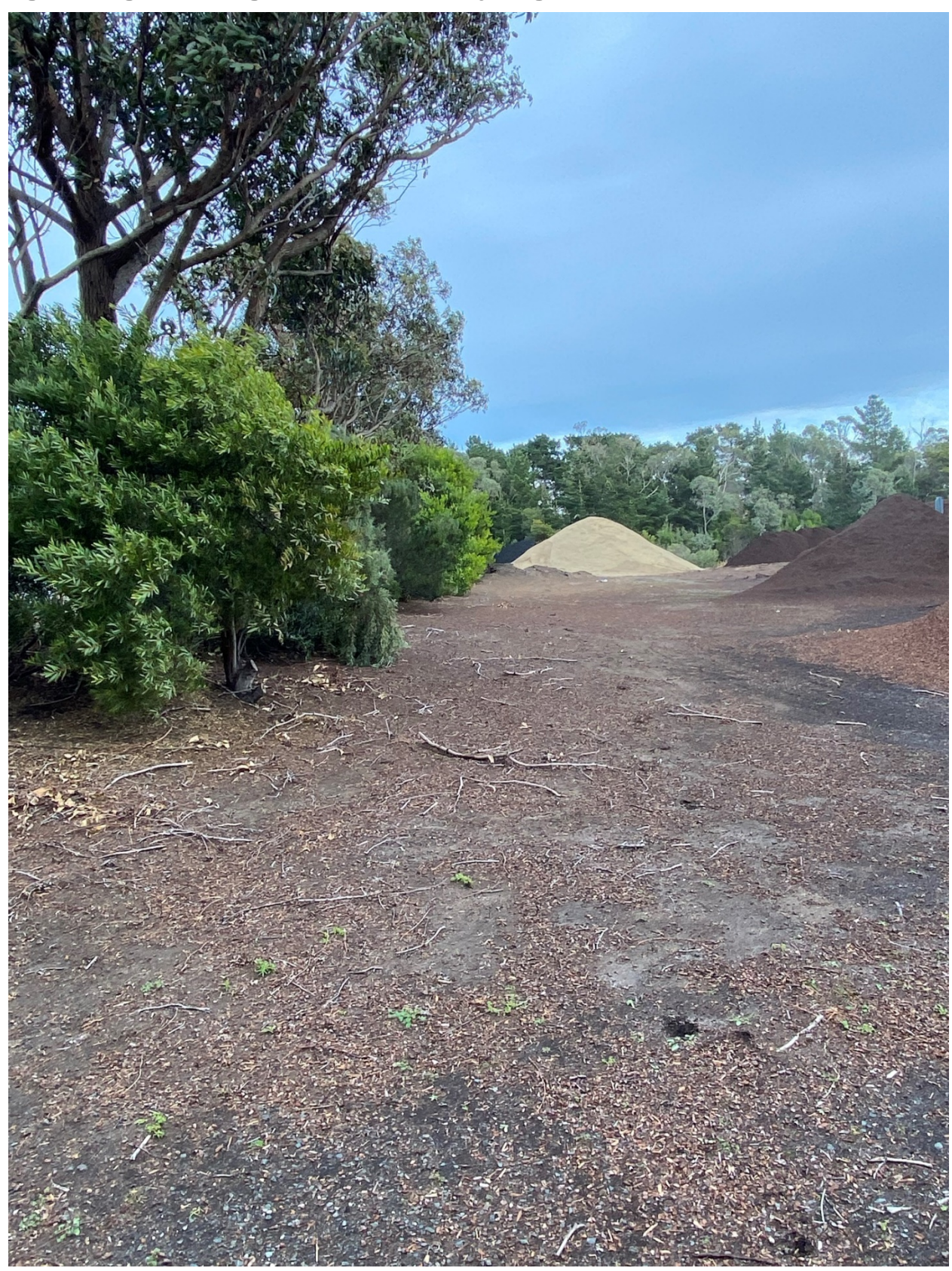
Figure 1: Vegetation along southern fence line adjoining LIP