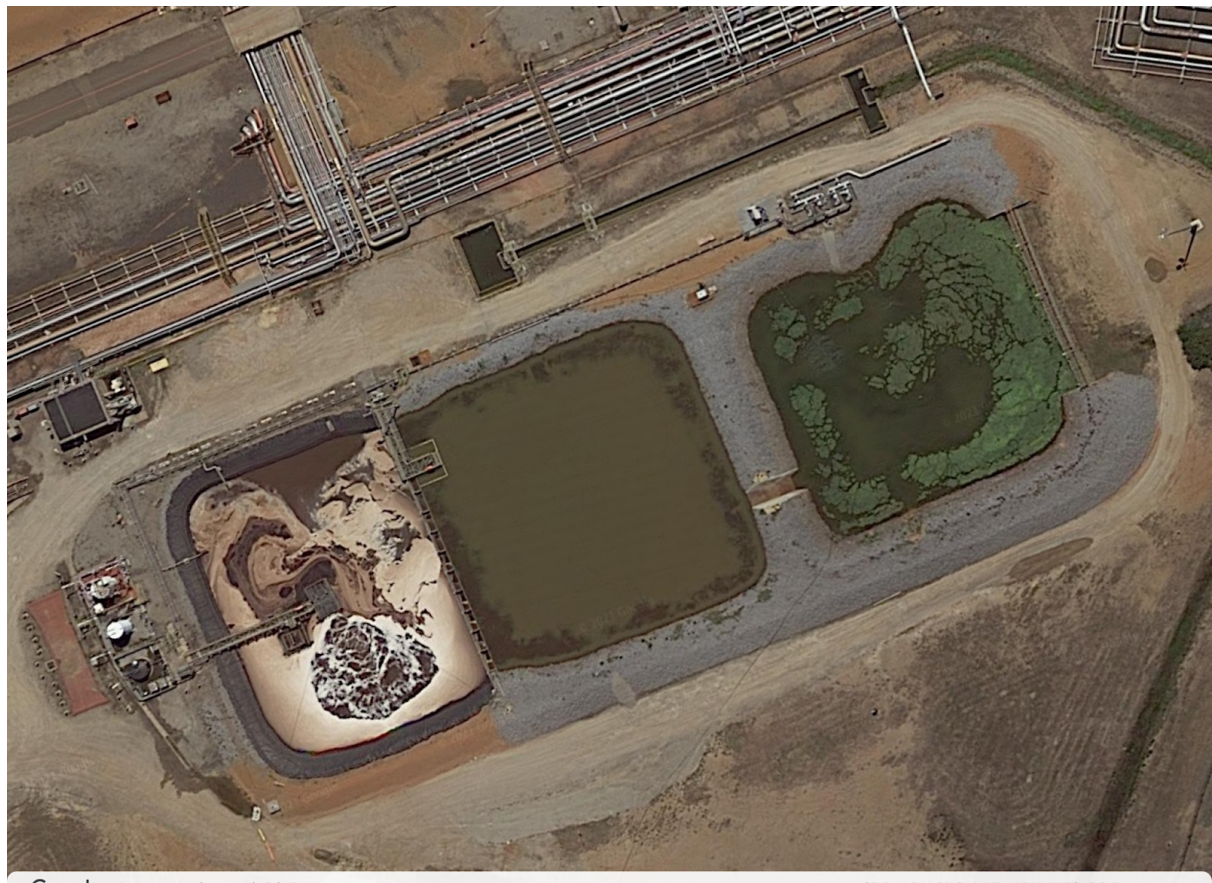
Google Imagery date: 1/12/18 – newer