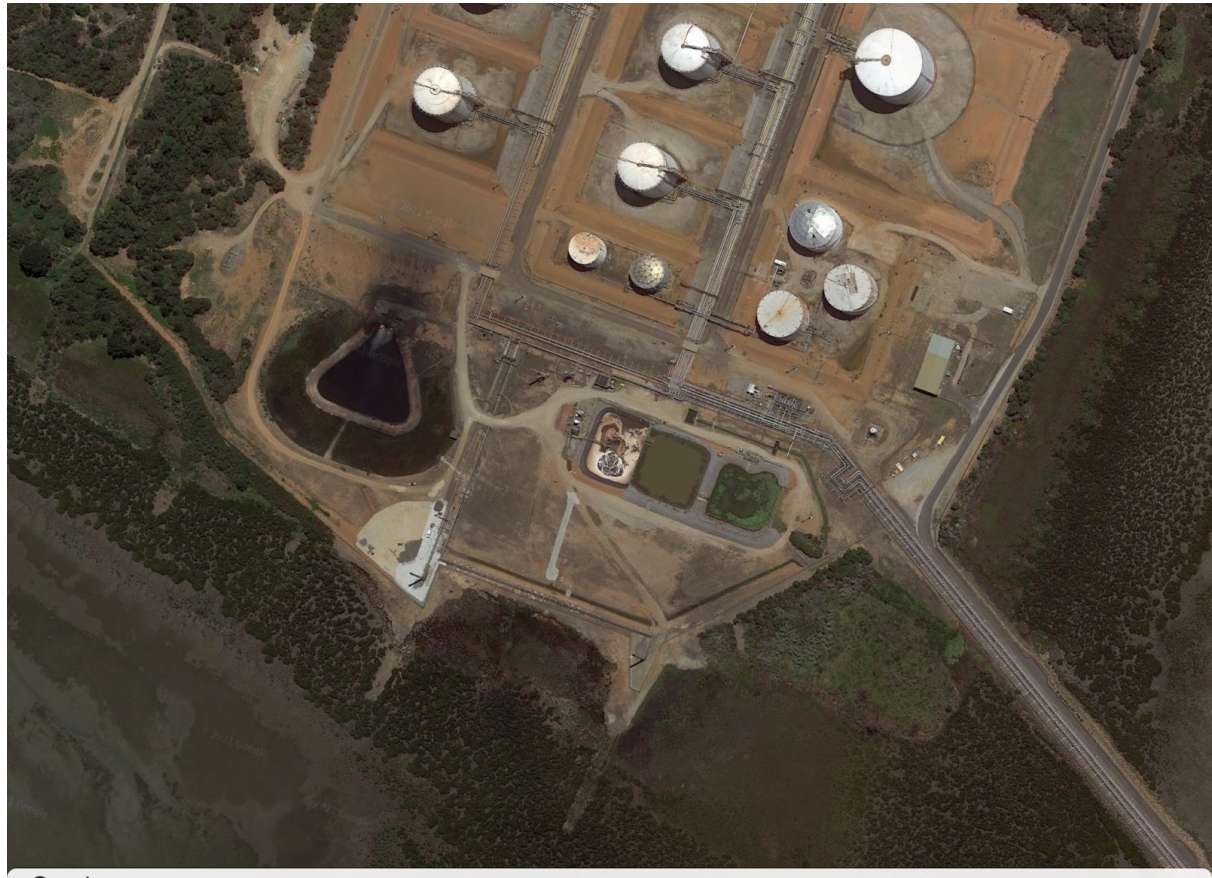
Google Imagery date: 1/12/18 – newer