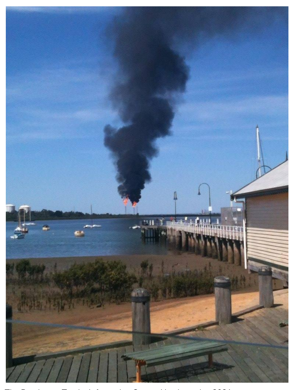
The Boathouse Tourist Information Centre, Hastings pier, 2021

"Map of proposed generator below, from <u>List of supporting docs</u> ESSO's application <a href="https://www.epa.vic.gov.au/esso-pty-ltd">https://www.epa.vic.gov.au/esso-pty-ltd</a>