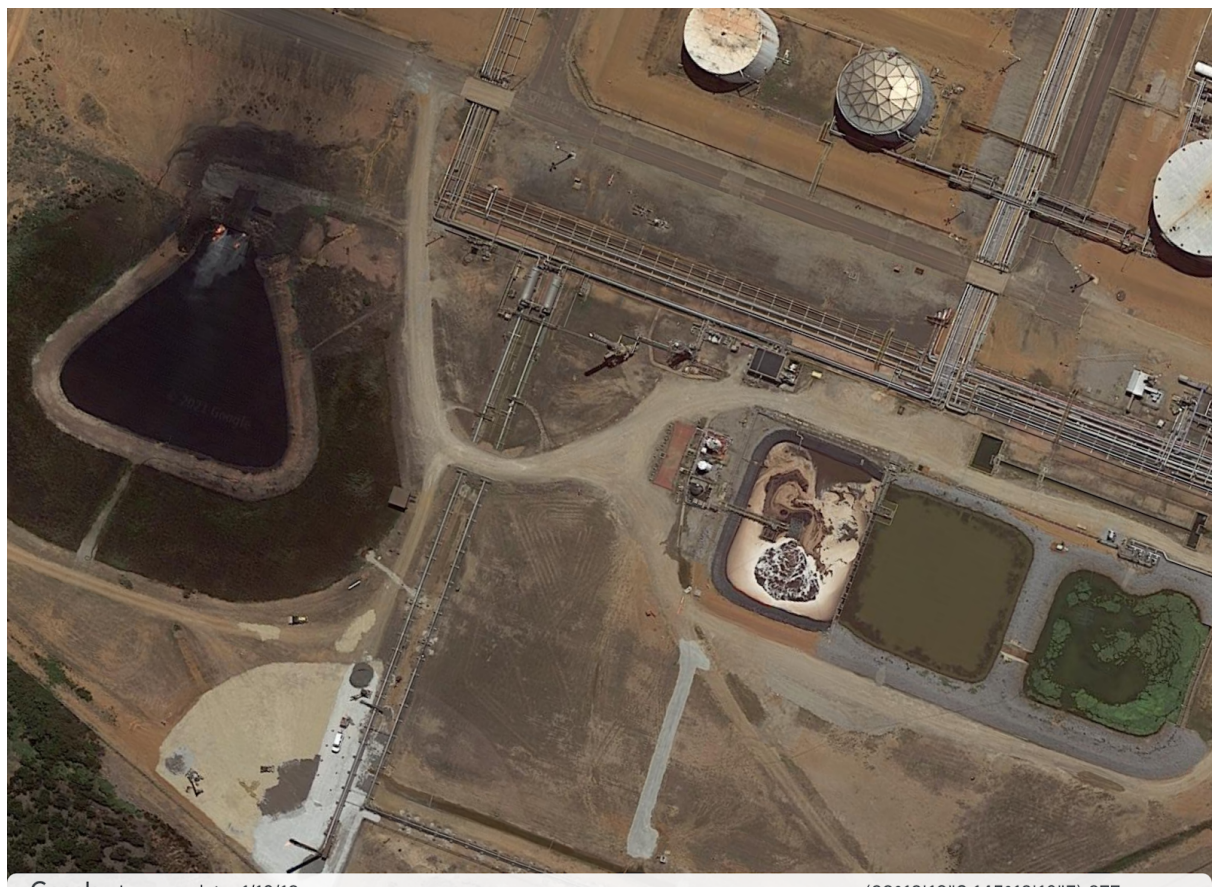
Google Imagery date: 1/12/18 – newer