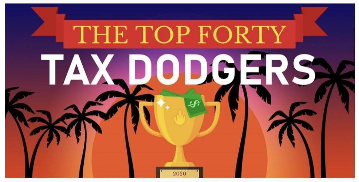
The Top 40 for 2020.