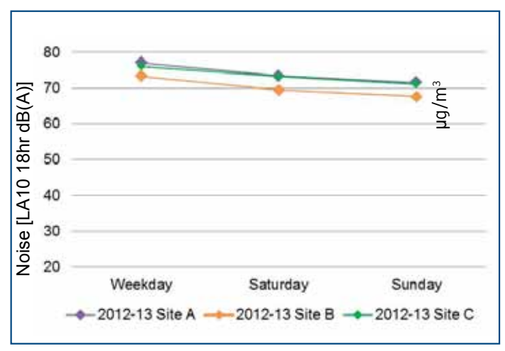
Figure 1: Average noise levels recorded at Francis Street in 2012-13.

Despite an increase in noise levels from 2002 to 2012-13 there has only been a 0.7% increase in the number of trucks travelling on the street during this time (Table 2).